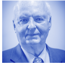
PROFESSEUR DIDIER SICARD

Senator of Val-d'Oise since September 24, 2017