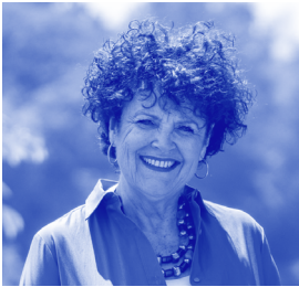
SENATOR JACQUELINE EUSTACHE-BRINIO

Senator of Val-d'Oise since September 24, 2017